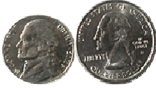
Installing energy saving features and not maximizing the thermal performance of the exterior wall is like walking over quarters to pick up nickels

RASTRA is the least expensive option by far over the life of the property providing the lowest cost-of-ownership available.